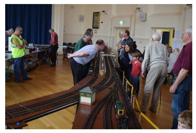
Our mission: to entertain and inform the public...