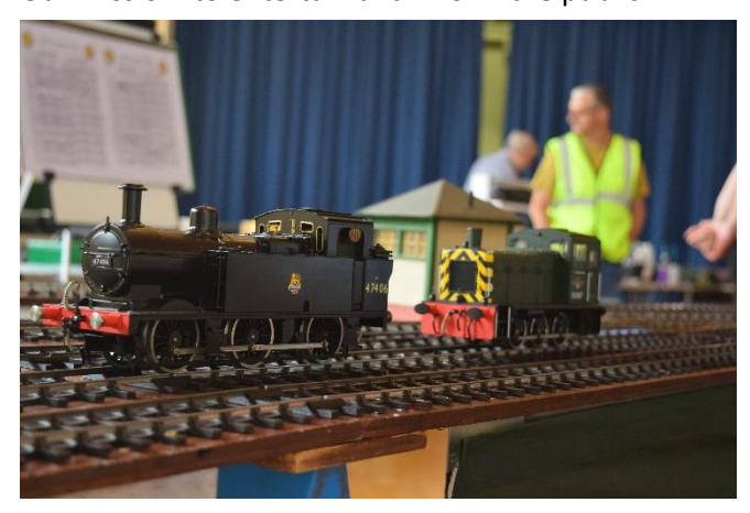
Jeff Rose's dock tank and Peter's class 03