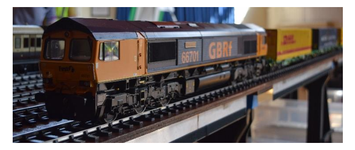
A class 66, minding its own business and not setting off any fire alarms