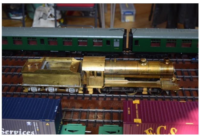
Yves' J38, now nicely run and doing sterling work