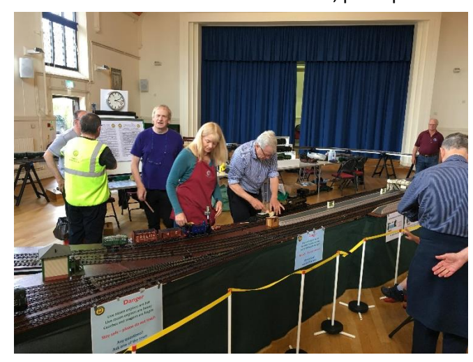
Elizabeth (J65) and Michael (Marsh Atlantic) steam up