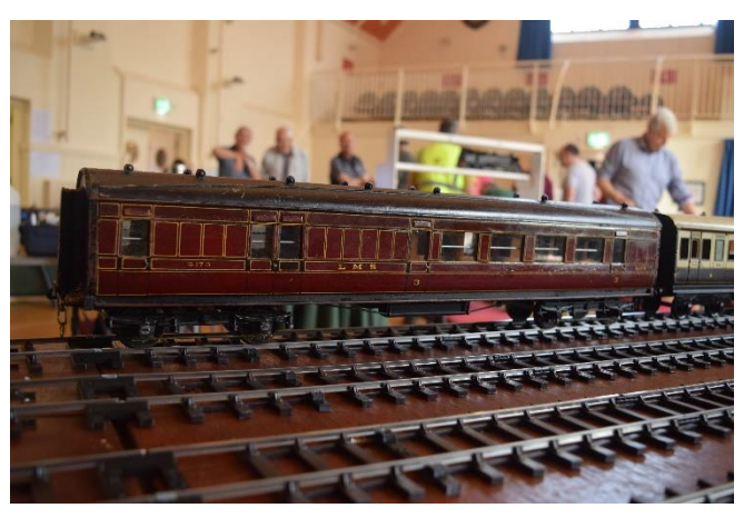
Michael's Mills Brothers LMS Brake 3<sup>rd</sup>, perhaps 1936